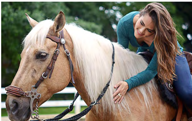
Okay, moving right along ...